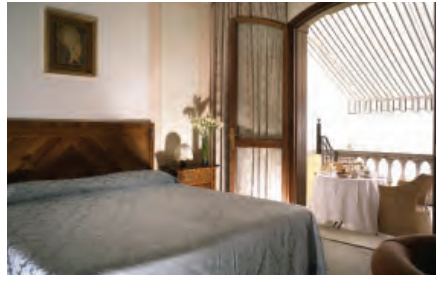
Villa del Sogno, superior room with terrace

The Eden Hotel Wolff has been one of the leading names in Munich since its foundation in 1890. The Art Noveau building is ideally located opposite Munich Central rail station, making it the perfect stopover point from which to explore the city. The hotel has 210 rooms and suites on offer to guests in a variety of designs from classical through to elegant modern or Alpine stylings, whilst the hotel's restaurant the Peter & Wolff prides itself on the use of seasonal products from the regions suppliers in its menus.