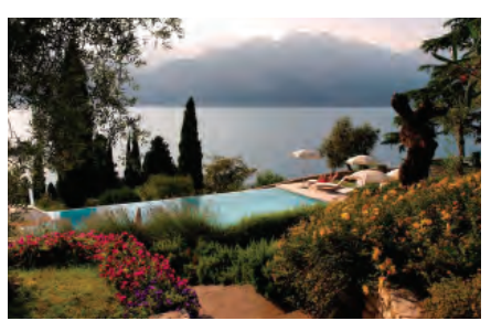
Bellevue San Lorenzo, pool and gardens