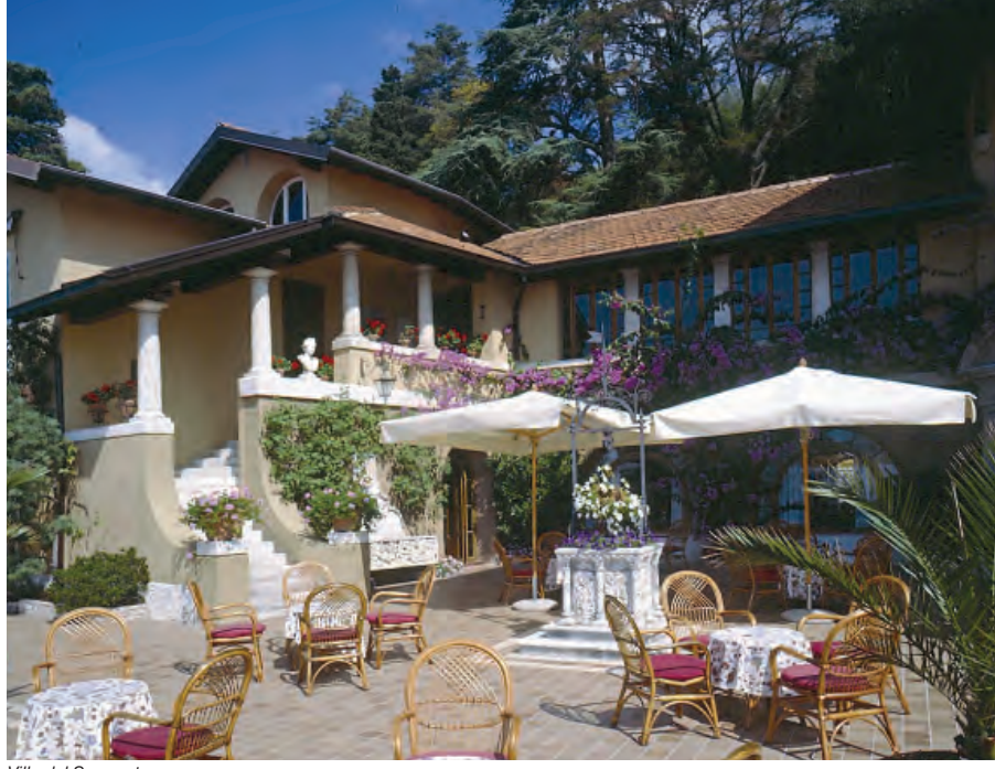
Villa del Sogno, terrace

This is a captivating hotel perched above the lake, offering comfortable and luxurious accommodation in attractive surroundings. The hotel is surrounded by a the beautiful park, whilst guests can admire the views across the deep blue waters from the large terrace. The rooms are divided between the original villa and the newer extension beneath the villa, where the style is much more modern and many rooms are equipped with balconies. The hotel's restaurant, the Maximilian, offers guests the choice to eat in the plush dining room or outside on the terrace whilst the garden bar offers lunch and light snacks by the pool.