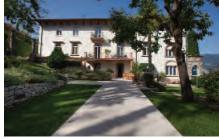
Bellevue San Lorenzo, exterior